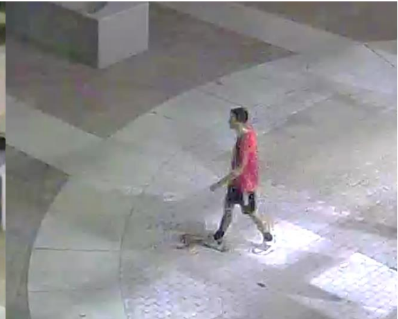
Subject 1: (Also in Photo 2) Wearing a red short sleeve shirt gym style shorts, black calf socks, and white shoes.